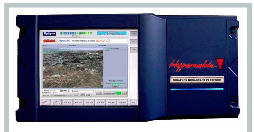
Basic Gigaplex 400/800-270xxx MVDDS HDTV 3,4-4,2 GHz 10,7-12,7 GHz 40,5-43,5 GHz

Basic Gigaplex MVDDS Broadcast and Backbone Transmitter comply new Green Radio specifications. Designed for quick MVDDS Digital and low cost Television and Internet deployment, the basic Gigaplex provide DVB-S 400 Mbits or 800 Mbits in DVB-S2 according to DVB standards and recommendations. No less than channels TV can broadcasted in HD standard (DVB-S MPEG4) by the Basic Gigaplex. EIRP is 35 dBm in omni-directional mode and 42 dBm in sectorial mode.