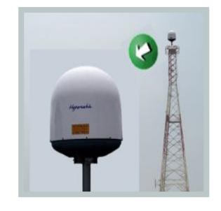
OPTION: Weatherproof de-icing radome for ODU transmitter and antennae system

An Hypercable repeater in the mountain. Powered by sun and windmill for satellite retransmission in a deep valley not line of sight to the satellite