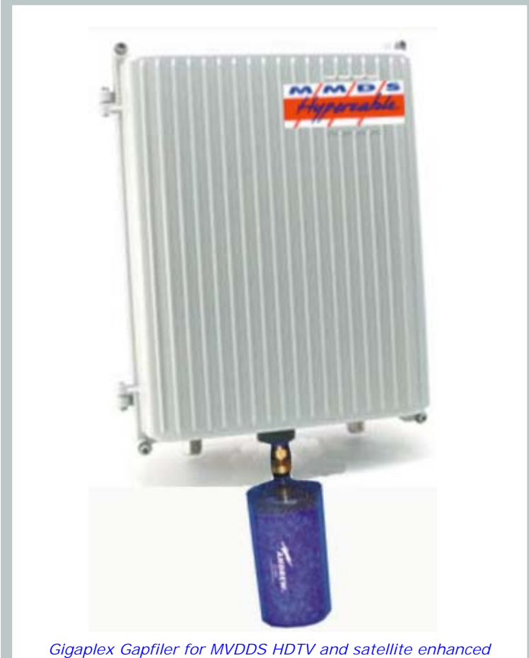
Gigaplex Gapfiler for MVDDS HDTV and satellite enhanced coverage and reliable service.

EIRP is 35 dBm in omni-directional mode and 42 dBm in sectorial mode, in Option high stability GPS reference clock can be provided.